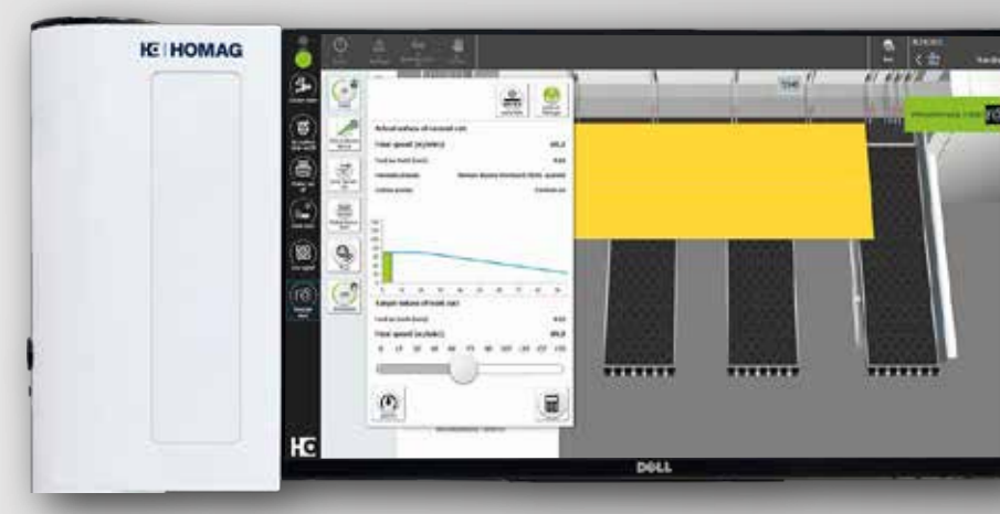
CADmatic Operating software for your saw