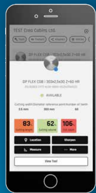
twinio Manage tools digitally